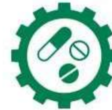
Healthcare & Pharma