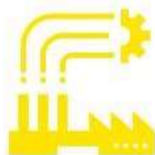
Manufacturing Power & Energy