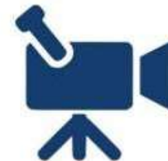
Media & Entertainment